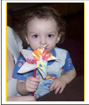
SMART BABY EVENT IN HOULTON.

Over the past two years we have seen how successful our playgroups have been in getting parents and children together to allow for opportunities for both the parents to connect and socialization for the children. In October 2006 we piloted our first Smart Baby event at our Central site in PI. The idea around the event was to provide play stations, created by our staff, that parents and children could