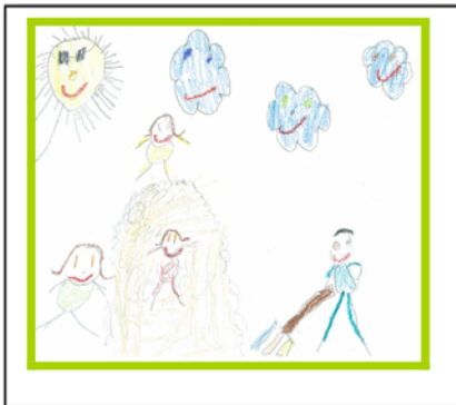
Kiersten age 7

Heading out into nature is a great way to soak up this colorful season and enjoy the outdoors before cold weather sets in. A walk in the woods, fields or even a park, gives kids an opportunity to witness the changing landscape up close. It's also a great way to come together after a busy school and work week. You don't need special equipment for an afternoon jaunt--just some jackets, water and snacks. Kids may also enjoy bringing along autumn journals and crayons for recording observations and making leaf rubbings, and small paper bags for storing treasures found along the path. Once home, kids can use these finds as craft materials. They can string acorns and seed pods for seed necklaces or use gathered leaves to print colorful autumn place mats or to stuff a scarecrow. Play name that leaf. Go out into the neighborhood or local park and have players collect five unusual leaves. Back home, try to identify the trees they came from using guidebooks or rake them into a huge pile and jump in!